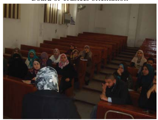
Faculty of Education orientation

• Materials used in Seminar sessions and training.