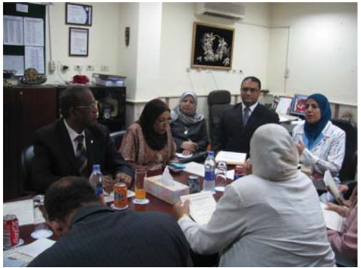
Board of Trustees orientation

• Presentation presented to Port Said Governor, Ministry of Education undersecretary in Port Said, Board of trustees, the other 2 school principals and the Dean of the Faculty of Education in Port Said.